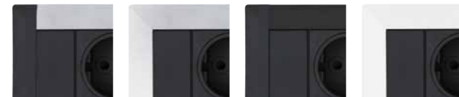
silver / black